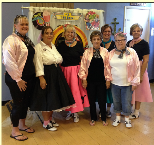
We had fun at our "Flashback to the 50s" on September 11th!