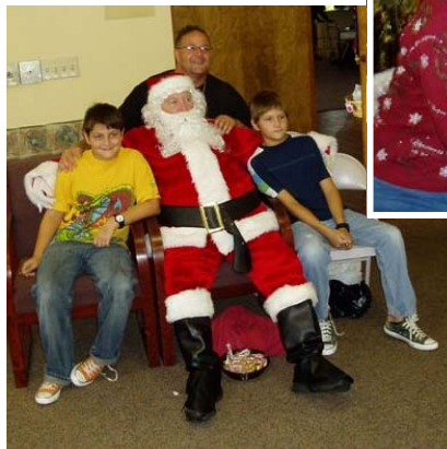
Fun at the "Breakfast with Santa" on Dec 3rd!